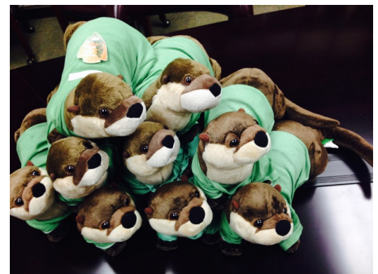
What do you call a group of otters? Answer: romp

The fall program serves as an introduction to the park. Students love maps and they pour over the MNRR brochure looking for familiar places along with their home town. It is this sense of place that connects them to the park and helps them realize how close they live to it. "Roscoe's River Report" is an interactive activity for the students which gives them a general overview of the MNRR. They learn that the Missouri River is the longest river in North America, that the park protects the piping plover, least tern and pallid sturgeon and that the values of the river include important historical and cultural ties. Roscoe also tries to emphasize the role they play as future stewards of the park and how to practice good stewardship.