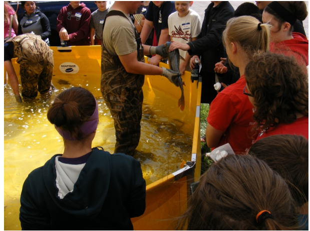
Students learn and touch fish at the Missouri Fish station with help from staff at Galvins Point National Fish Hatchery.

Lake Yankton Outdoor Festival was started in 2014 for the public to attend some of the events the students participate in at the Missouri River Watershed Festival. This event gives an opportunity to reach more of the public and engage them in activities that can be done utilizing our wonderful natural resource, from fishing to camping, to issues facing the Missouri River, and safe boating practices. The committee is considering bringing back for the 2018 year cardboard boat races. Teams build boats out of cardboard and race.