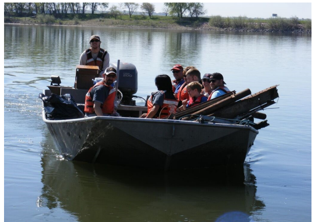
Volunteers arriving back to the Yankton's Riverside boat ramp with a load of river trash.