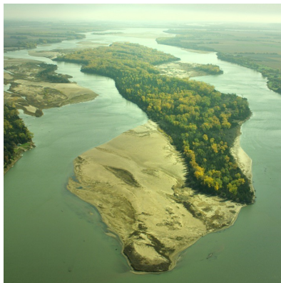
Goat Island is now part of the MNRR.

FOMNRR members have continued to work on development and maintenance of trails along the river. The Frost Trail was created by FOMNRR members and other volunteers in 2017. The trail is a way for the public to experience a wild and scenic stretch of the river on foot. FOMNRR members volunteer to lead various community groups on interpretive hikes along the trail. We continue to look for new trail opportunities along the MNRR.