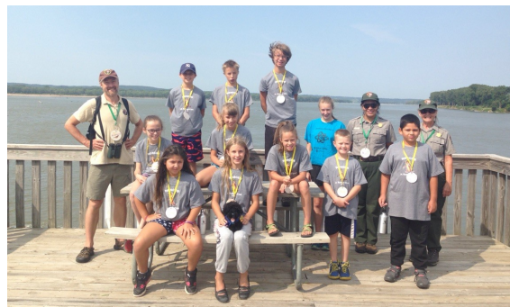
2018 Graduates of the Roscoe Junior Ranger Academy.