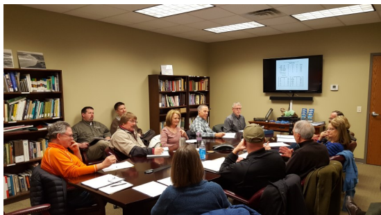
FOMNRR Board meets six times annually.

FOMNRR will assist the Park Service in promoting the Island's attractions, as well as in maintaining the Island's natural condition.