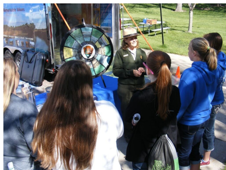
Students at the River Watershed Festival.

The past year has seen progress and expansion for the Friends of the Missouri National Recreational River (FOMNRR). Board members have been working hard to improve our visibility and engage others. Member recruitment continues to be a focus for this young organization. Expanding our membership base both upstream and downstream is important to the growth of the FOMNRR. As our membership base increases, so does the momentum we build to accomplish more projects and take on more activities.